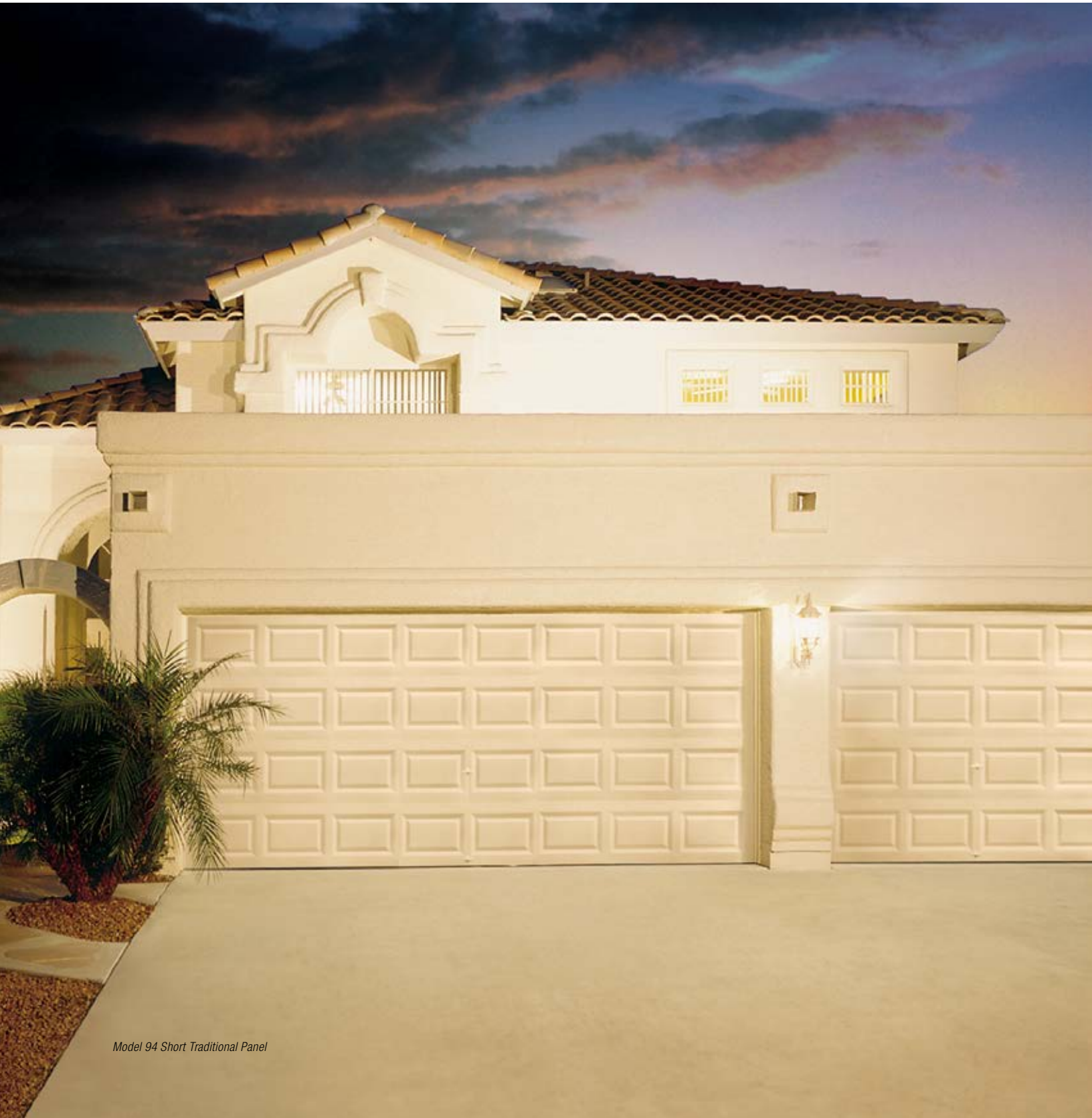
Model 94 Short Traditional Panel