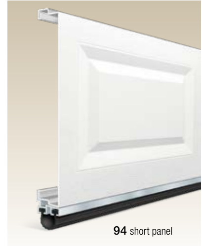
94 short panel