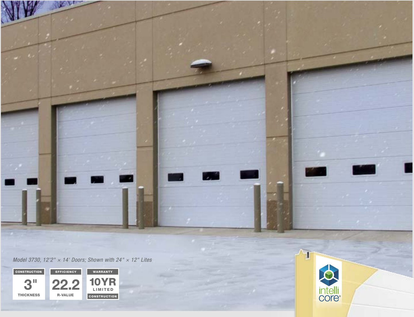
Model 3730, 12'2" x 14' Doors; Shown with 24" x 12" Lites