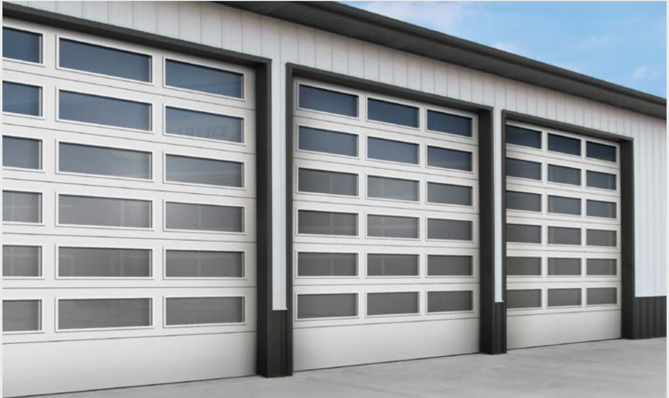
Model 3708, 12' x 14' Doors; Shown with 42" x 16" Lites