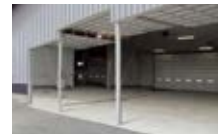
Carry-away, roll-away or swing-up mullions are available on select sizes.