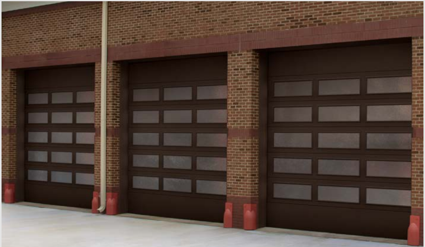
Model 3208, 12'2" x 14' Door; Shown with 42" x 16" Lites