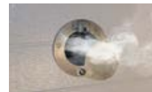
Can be cut into any type of sectional door. Available in select sizes.