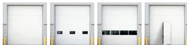
MODEL U100 closed door